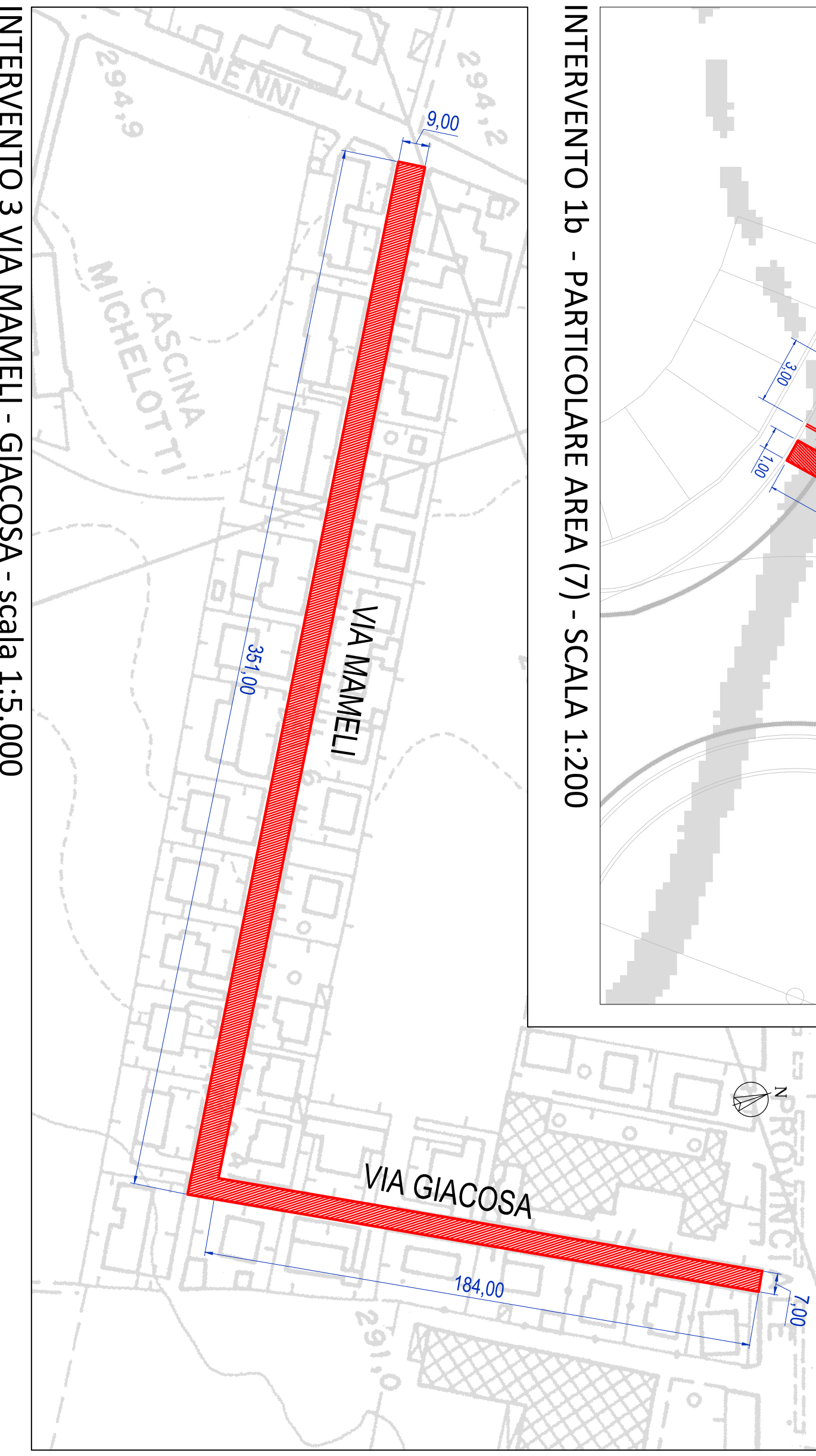
INTERVENTO 4a VIA DI VITTORIO - scala 1:1.500